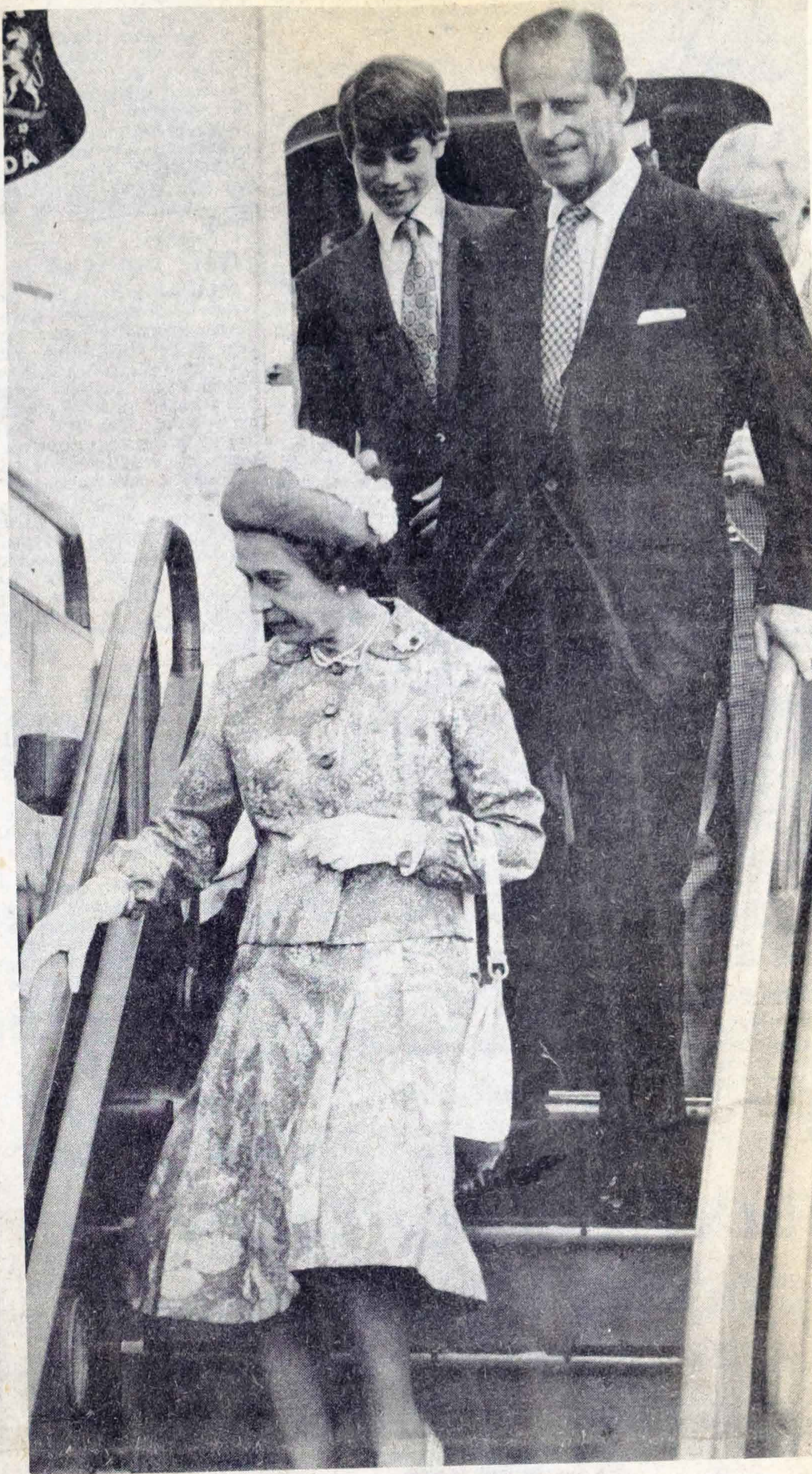
ROYAL FAMILY ARRIVES IN REGINA... warm welcome received