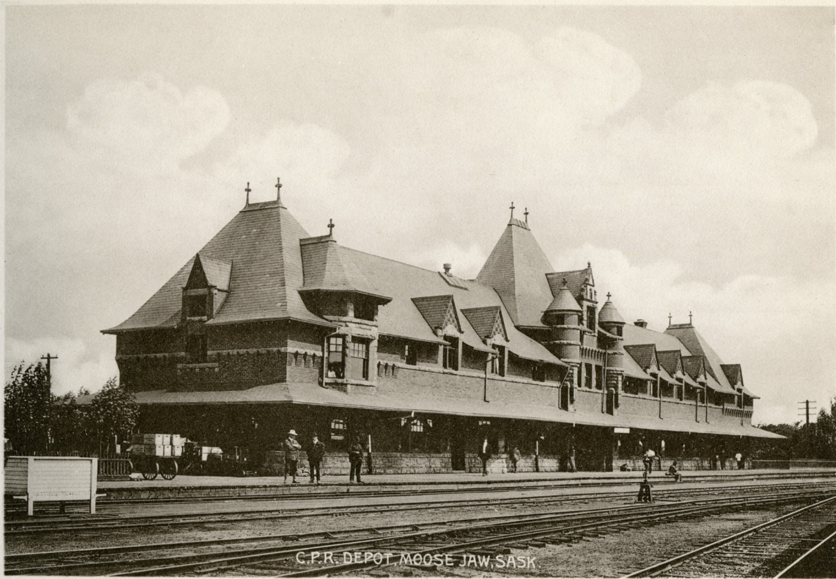
C.P.R. DEPOT, MOOSE JAW, SASK.